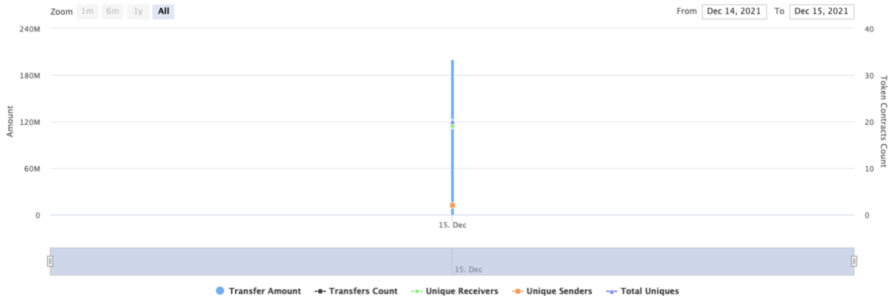
Token Contract 0x8c18ffd66d943c9b0ad3dc40e2d64638f1e6e1ab (HerityNetwork)